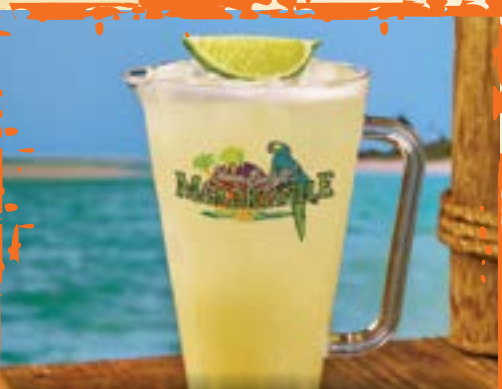
BOOZE IN THE BLENDER

Margaritaville Silver Tequila, Blue Curaçao and our house margarita blend. Served on the rocks (280 calories)