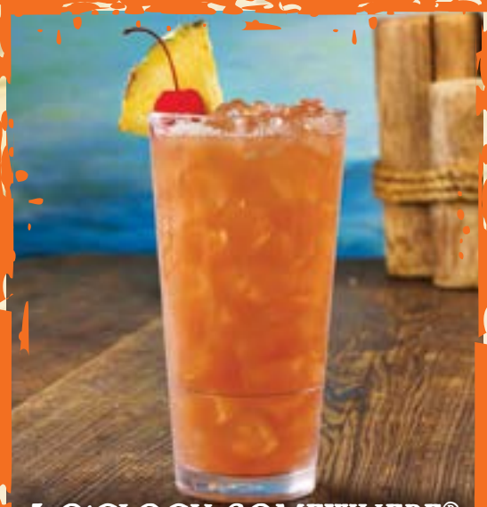
5 O'CLOCK SOMEWHERE®

Myers's® Original Dark Rum blended with blackberry and banana purées and topped with Cruzan® Hurricane Proof Rum. Served frozen (310 calories)